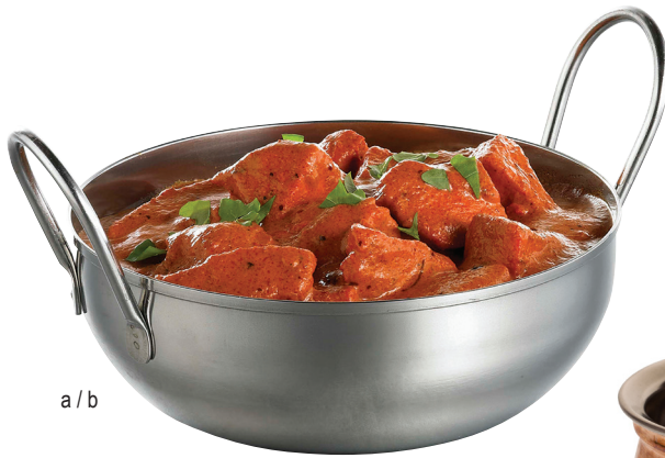
a / b